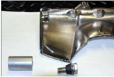
Suzuki C90