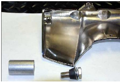
Suzuki C90