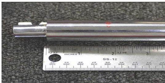
Yamaha

Our install guides provide a basic outline on the proper installation of our products. Further tuning and/or fitment may be required. Barons bears no responsibility on installation costs associated with this product.