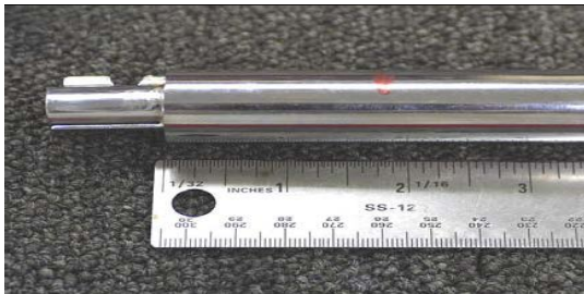
Yamaha

Our install guides provide a basic outline on the proper installation of our products. Further tuning and/or fitment may be required. Barons bears no responsibility on installation costs associated with this product. © 2019 Barons Custom Accessories